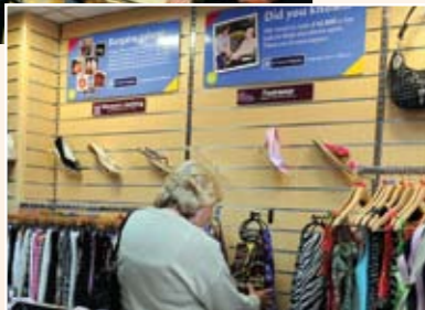
New signage in Cheadle